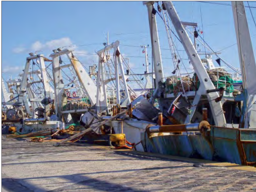
Italian trawlers in Mazara del Vallo, Sicily, the most important Mediterranean fishing port. The ILO Work in Fishing Convention, 2007, covers employees of the fishery sector too