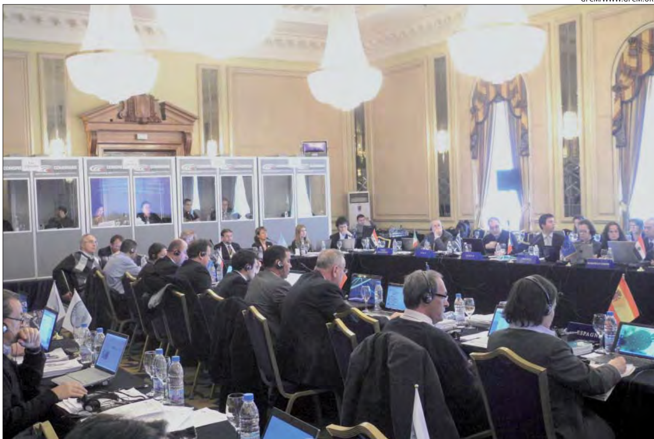
14th session of GFCM-SAC at Sofia, Bulgaria, during 20-24 February 2012. GFCM is the first RFMO to acknowledge the role and rights of fishworkers in fisheries management

the physical environment. Workers should be full participants in the implementation and evaluation of activities related to Agenda 21”.